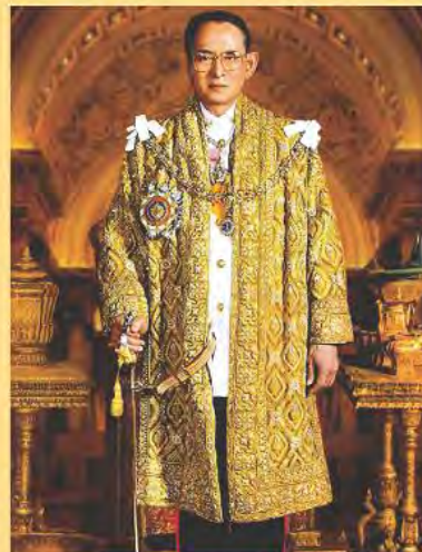
His Majesty King Bhumibol Adulyadej December 5, 1927 - October 13, 2016 “His Majesty is always in our hearts forever”