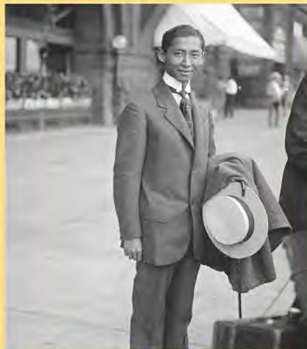
Prince Mahidol of Songkla on his way to Gloucester, MA, August 26, 1916

In honor of His Majesty King Bhumibol Adulyadej & Prince Mahidol of Songkla