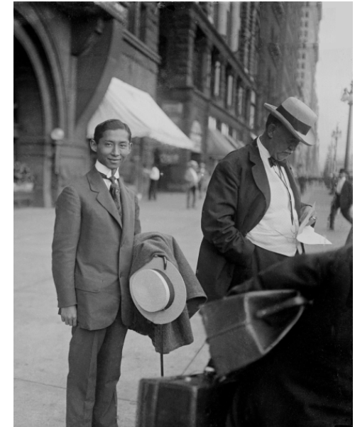
Prince Mahidol on the way to Gloucester, Massachusetts, August 26, 1916

15 Given Drive Burlington, Massachusetts 01803 Phone (781) 365-0083, Cholthanee Koerajna ktbf@thailink.com ~ www.thailink.com/ktbf/ Introducing our organization and the Trail of Thai Royalty in Massachusetts and New Hampshire