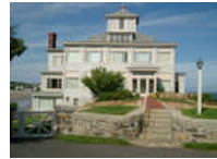
Sherman Cottage Gloucester: 24 Bass Rocks Rd