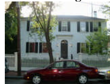
11 Hawthorn Street

Originally located at the corner of Brattle and Church streets, Prince Mahidol occupied it from 1916 to 1918 while studying at Harvard.